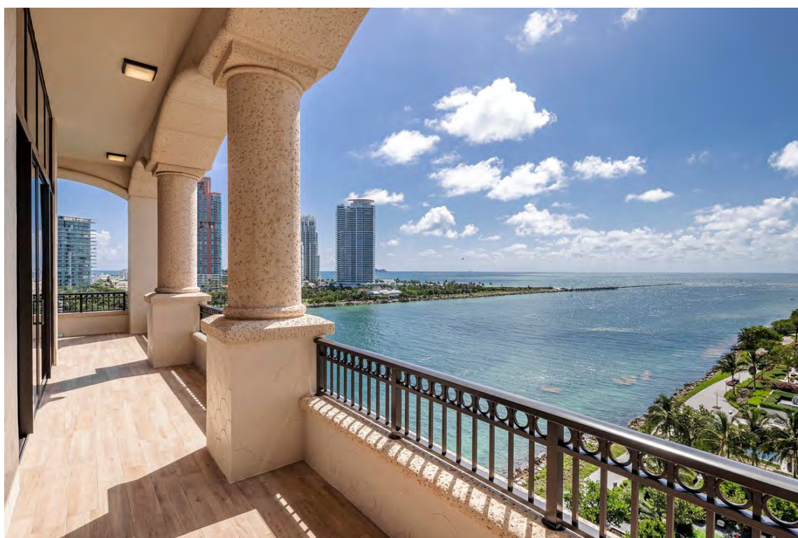
Palazzo Della Luna on Fisher Island.