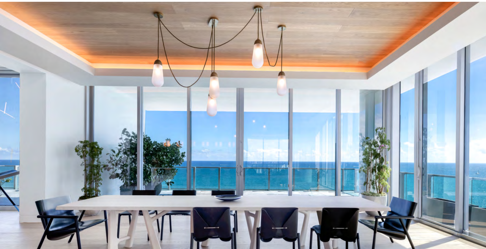
A dining room. Lifestyle Production Group