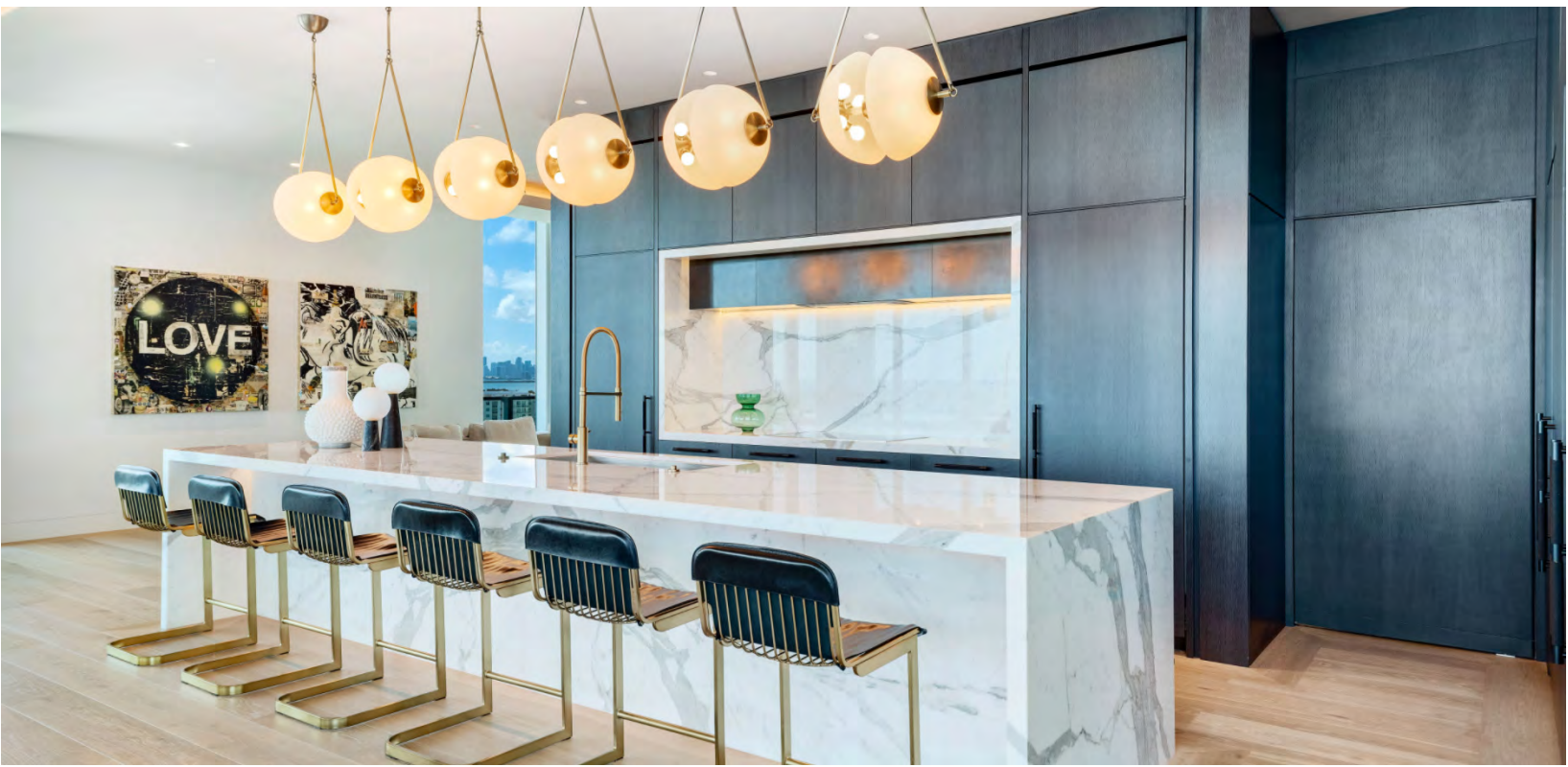
The kitchen has bar seating. Lifestyle Production Group