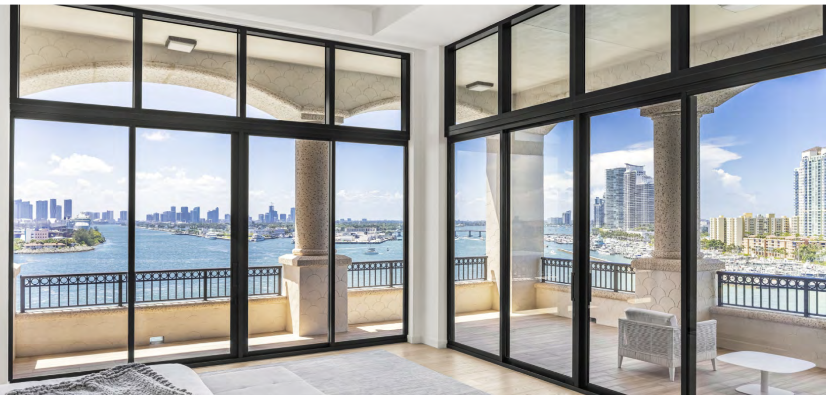
The condo has over 10,000 square feet of indoor space. Kris Tamburello/Palazzo Della Luna