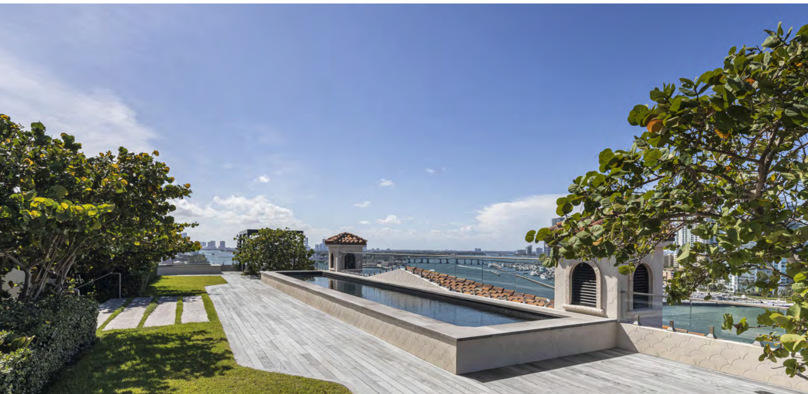
The penthouse has a rooftop patio with a pool.