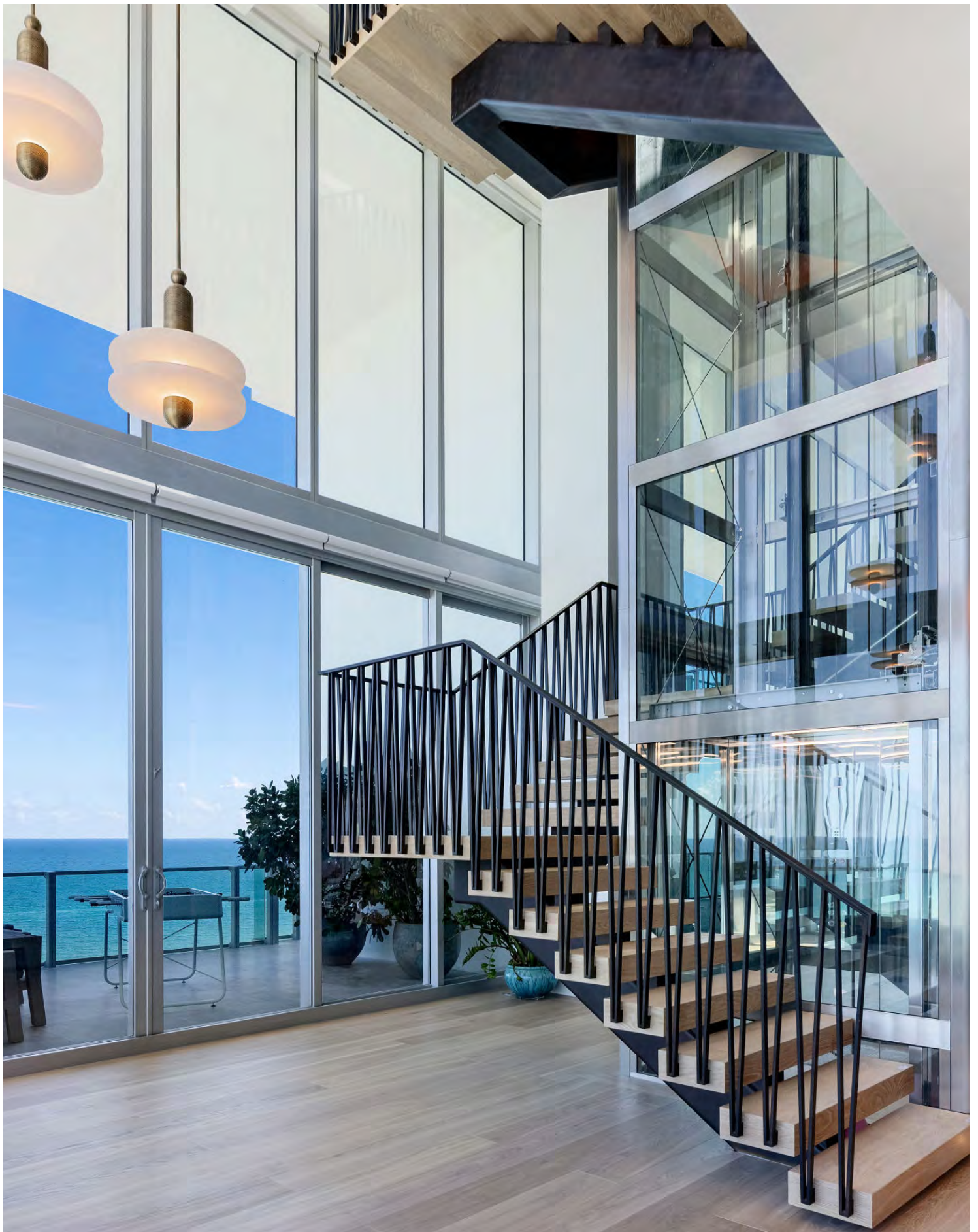
A floating staircase with brass railings wraps around a glass elevator. Lifestyle Production Group