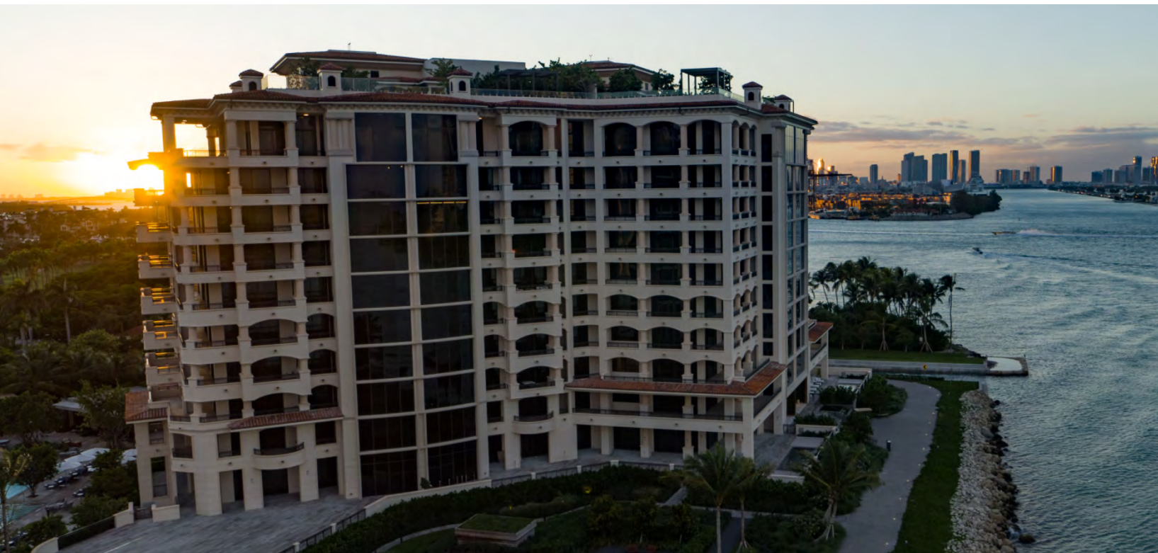
An exterior of the building on Fisher Island. Palazzo Della Luna