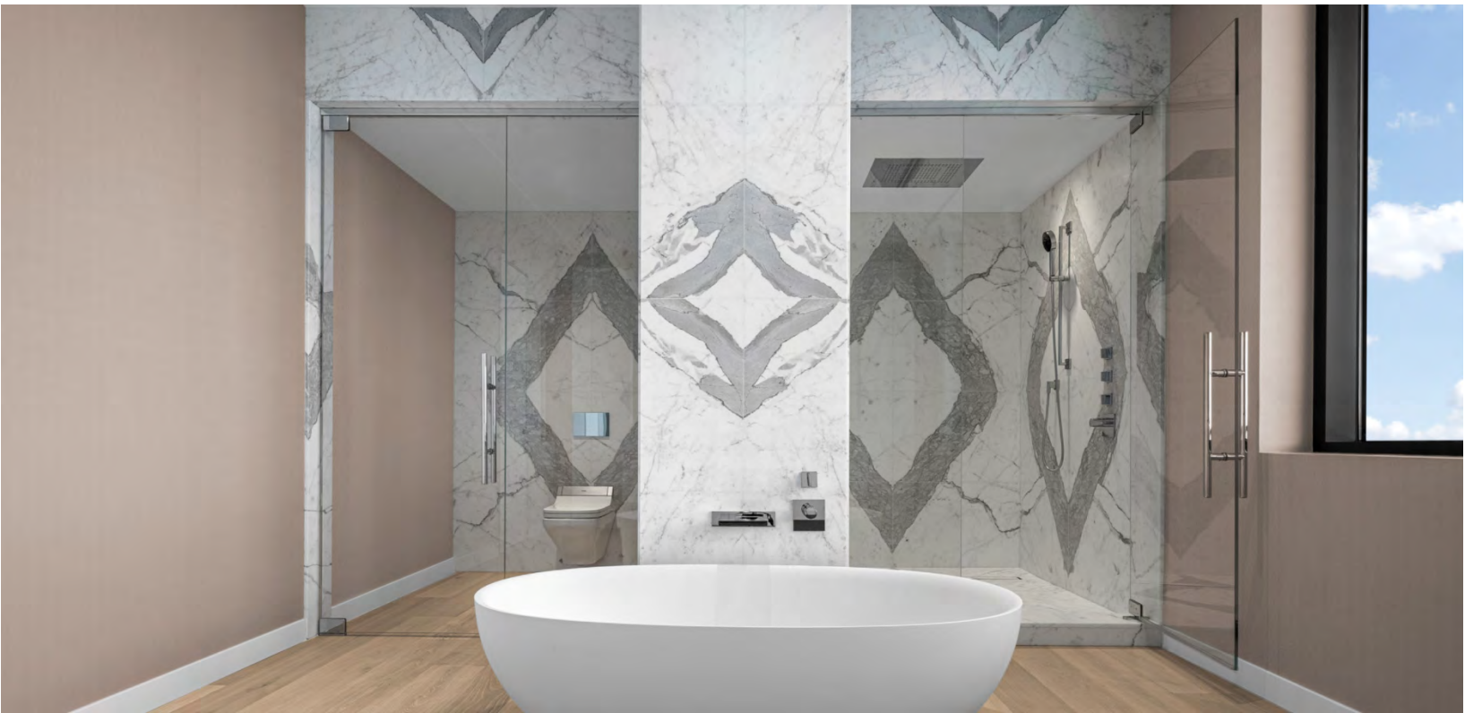
A bathroom. Kris Tamburello/Palazzo Della Luna