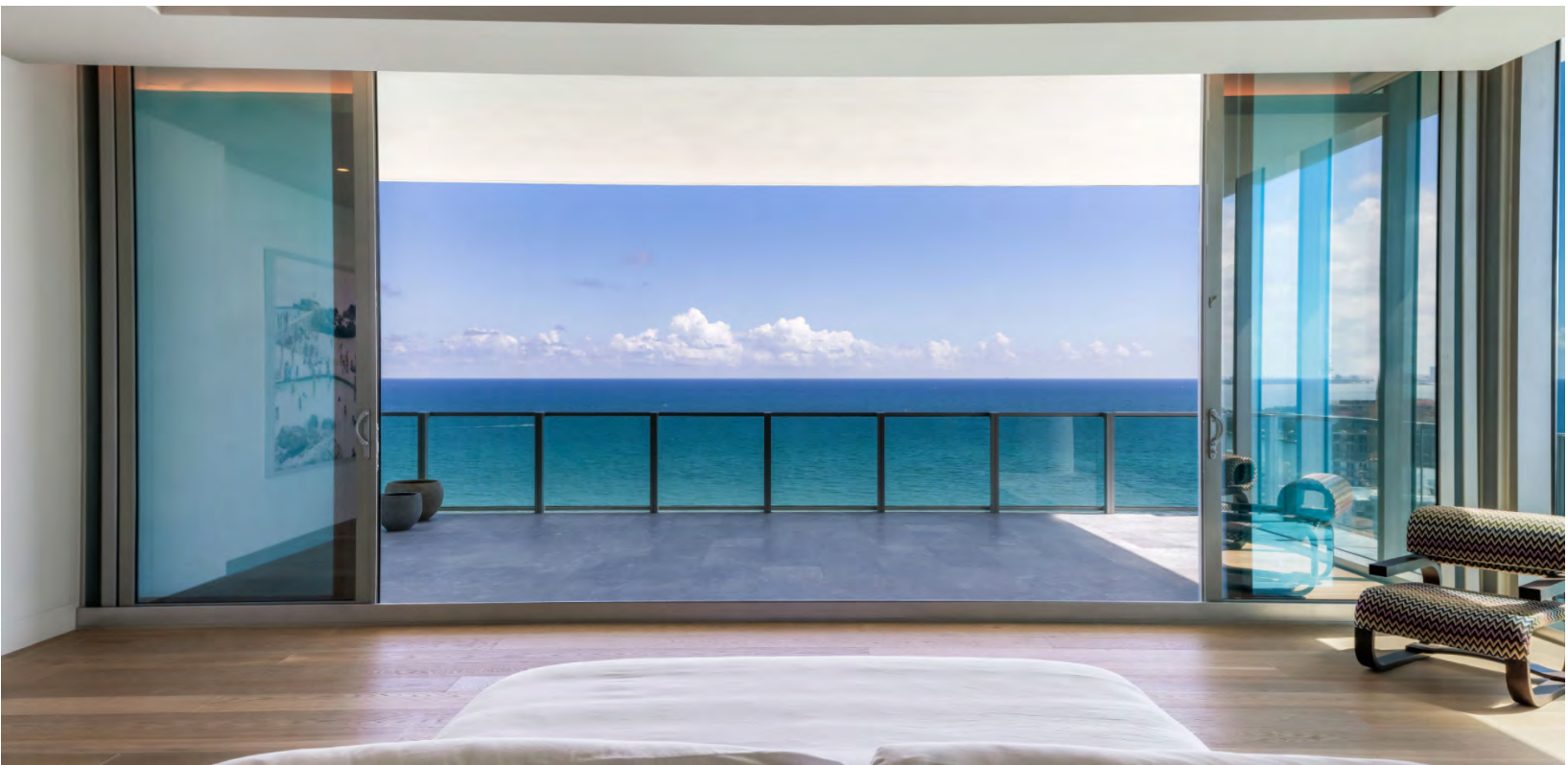
A bedroom with a terrace. Lifestyle Production Group